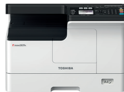
Paper Feed Unit