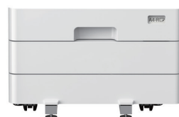
Paper Feed Pedestal